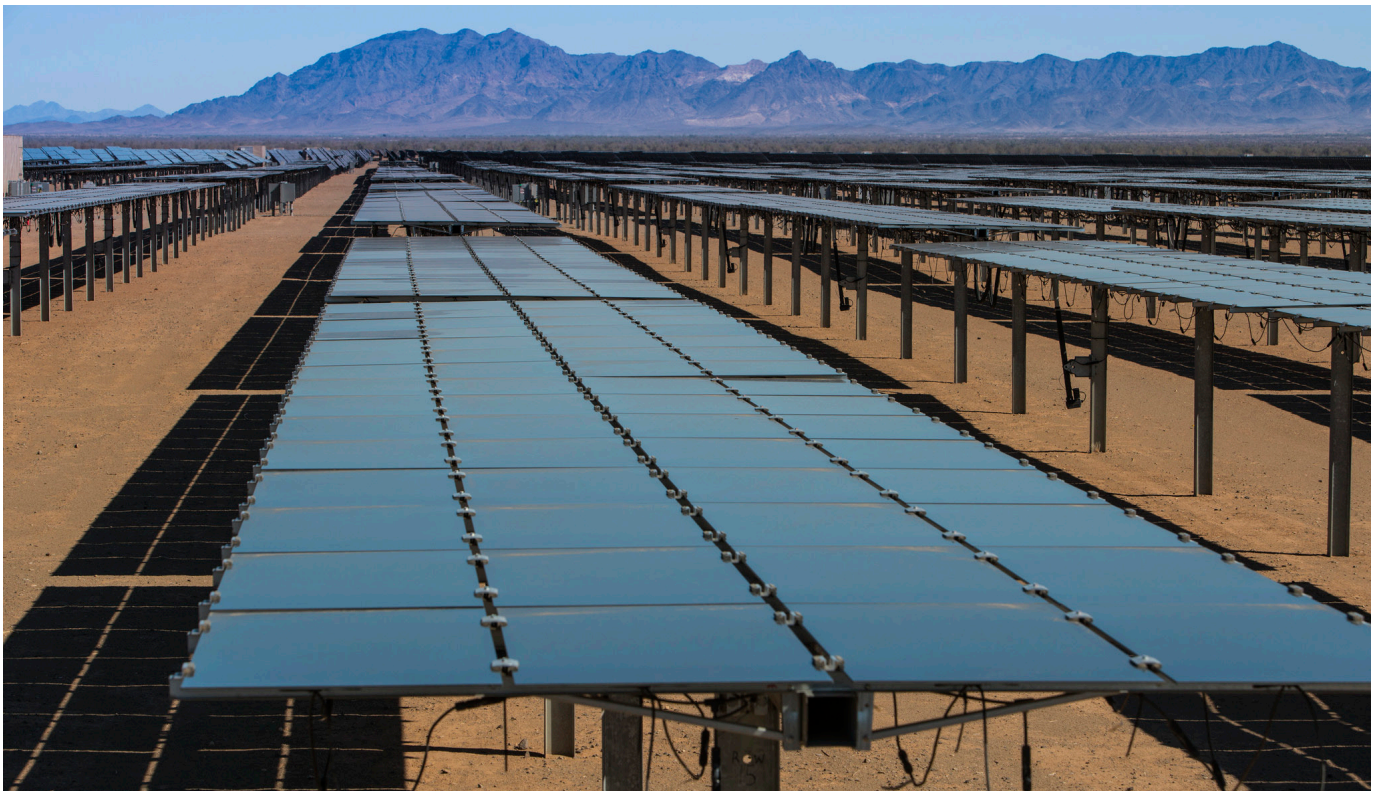
If properly sited, large scale solar energy projects like this one in California can help meet our nation's energy goals without unduly harming endangered species.