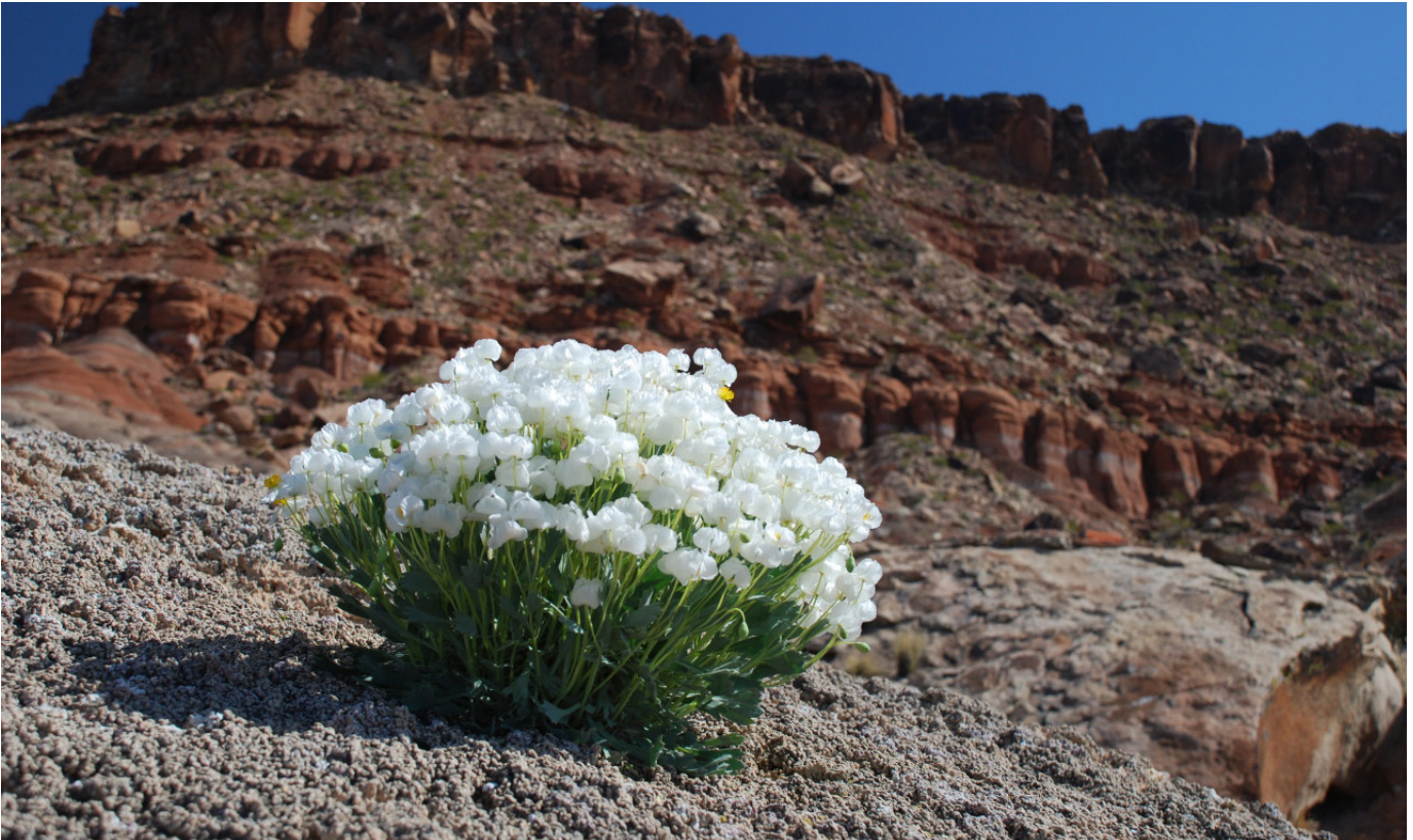
Federal lands support a large variety of ESA-listed and at-risk species, including the dwarf bearclaw poppy. Getting mitigation right on federal lands is crucial to conserving these species.