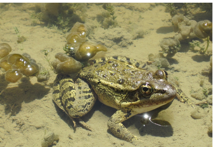
The California red-legged frog is one of the few dozen species for which species conservation banks have been established.

• Public availability of monitoring data on mitigation outcomes. Considering that effective mitigation techniques do not yet exist or are poorly documented for many ESA species, monitoring the outcomes of mitigation programs is of utmost importance to determining whether those programs achieve their conservation goals. Too often, the Services permit activities without having the capacity to review whether the associated mitigation measures have been implemented and are effective, and without clear compliance criteria for enforcing those measures. The 2016 Mitigation Policy briefly addresses the effectiveness issue, explaining that “the Service encourages, supports, and will initiate, whenever practicable and within our authority, post-action monitoring studies and evaluations to determine the effectiveness of recommendations in achieving the mitigation planning goal.” It further explains that “should a mitigation project fail to meet its performance criteria and therefore fail to provide the expected conservation for the species, the responsible party must provide equivalent compensation through other means.” Although these statements