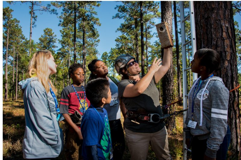
Nesting boxes are a common type of offset for the red-cockaded woodpecker.

Another example comes from the ESA Compensatory Mitigation Policy, which describes the requirements for transitioning CCAAs and safe harbor agreements to offset credits. By describing the requirements, the policy creates a faster, clearer process for qualified agreement participants to supply credits.